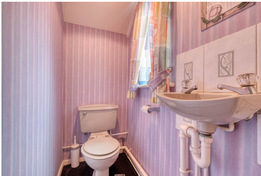
Snowhill Close, Redditch